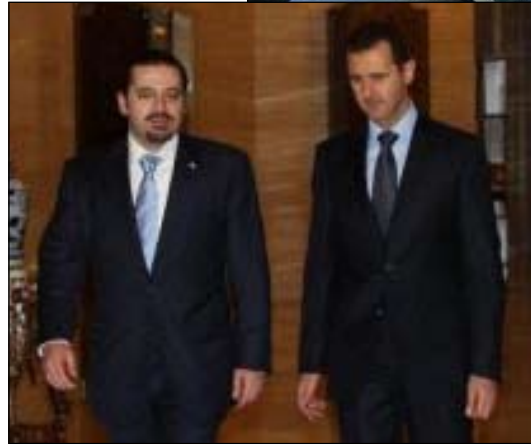
During Saad Hariri's unique premiership, which ran from November 9, 2009 to June 13, 2011, a Saudi-Syrian rapprochement took place following Hezbollah's Beirut blitz (May 2008) and the Doha agreement. As Prime Minister, Hariri visited Damascus twice, in December 2009 and May 2010.