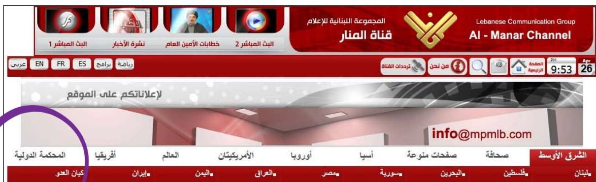
A quick review of the navigation bar on the al-Manar TV homepage conveys an immediate understanding of the gravity Hezbollah and its media outlets ascribe to the STL issue.

The STL responded to publication of the witnesses' names by observing, "[T]he list of persons that could be placed at risk by this irresponsible website is not an accurate reflection of official court records." 8 Since then, it has chosen to make good on its threats to cite for contempt of court