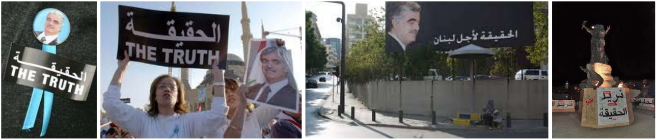
In 2005, every conceivable medium was used to demand “the truth.” Here, pins, banners, placards and even the pedestal of the martyrs statue—which became an improvised billboard—were pressed into service to advance the claim “We want the truth!”