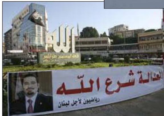
At certain times, the concept behind “Justice” was as fashionable as that behind “Truth.” On the left, a billboard emblazoned with a portrait of the late prime minister and the STL logo reads, “Justice is my Right.” The banner to the right, hung on the fence that borders Tripoli’s main traffic roundabout, featured a picture of Saad Hariri and was signed by an obscure group called “Sportsmen for Lebanon.” It reads, “Justice is God’s Commandment.”